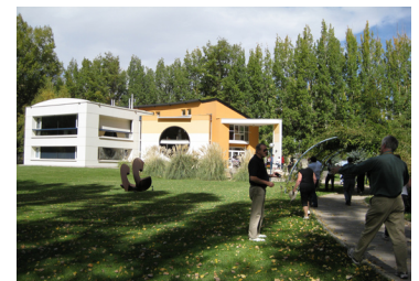
The Auger observatory