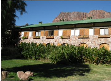
Our hotel in Mendoza