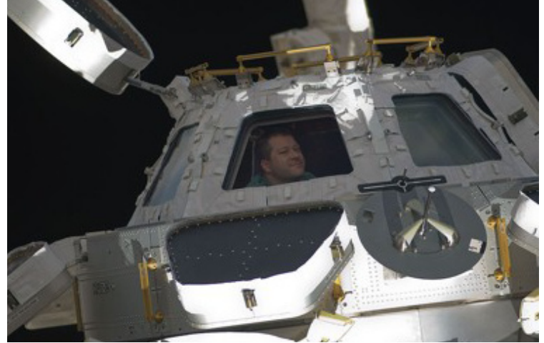
Astronaut Nicholas Patrick looking out the Cupola windows of the International Space Station.

The trail went cold in April and it looked like all the leads were hitting dead ends. We were even told by one person that we'd have to pay for such a project.