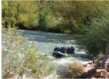
Rafting on the river

Thursday morning we awoke to sunshine and a bright blue sky. We found ourselves in a gorge (Cañón del Atuel) with a rushing river of clean, clear water right behind the well-appointed hotel. All meals were served in the rather large dining room, which overflowed with meeting attendees—roughly two-fifths were English-speaking, the rest Spanish. The two groups mingled well, and had fun trying to speak and understand each other's language. Also, the predominately Italian-style food was delicious.