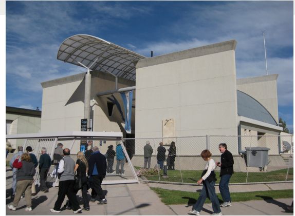
Meeting attendees visit the Malargüe Planetarium