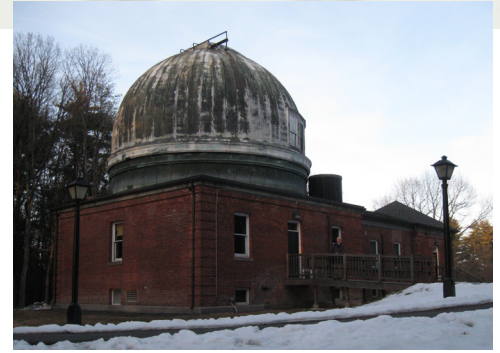
The Wilder Observatory of Amherst College