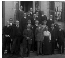
1916 Annual meeting