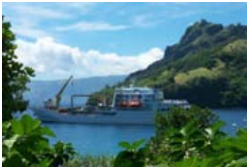
Aranui 3.

A highlight of our trip was the glorious southern sky with views of the Milky Way from eta Carinae across to the naked-eye clusters M6 and M7 in Scorpius in the evening sky. Before dawn, both Clouds of Magellan were visible. There were frequent green flash watches from deck, one of which was rewarded.