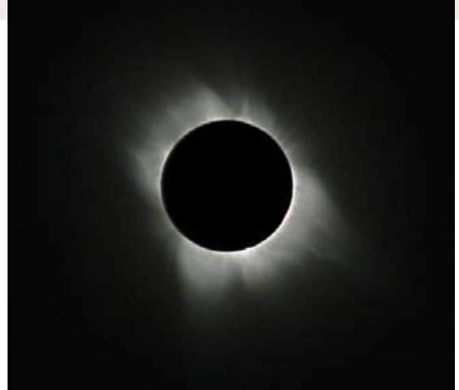
A photo of totality by Robert Kaufman using his Canon 400D DSLR on a tripod. This image is a composite of three exposures of 1/2000, 1/500, and 1/40 second on a 200mm focal length lens at ISO 400 and f/9.

Despite being the dry season, typically, each day there were quite a few clouds bubbling up. On the morning of the eclipse, we had planned to go ashore in Hikueru in the Tuamotu Archipelago, but this was abandoned. There was just too much cloud here and there in the sky for comfort, so we steamed a further 45km southeast. At the start of the eclipse, our location was about 10km north of the island of Marokau. Before totality there was a large clear area overhead with the occasional cloud, but, fortunately, this had little effect on viewing the partial phase. Just before second contact (start of totality) a thin cloud moved across the sun, producing a beautiful atmospheric halo, but it cleared just in time for a spectacular diamond ring. The corona had several beautiful streamers and the polar brushes were prominent. Also visible in binoculars were a number of small prominences. Jupiter, Sirius, and Mercury were easily seen and the shadow bands were clearly visible against a white satellite antenna on the ship. Totality lasted about four and a quarter minutes and another sharp diamond ring signaled the end of the spectacle. ★