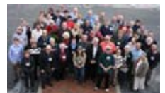
2008 Annual meeting

Dec. 26, AAVSO —The AID reaches 19 million observations in 2010.